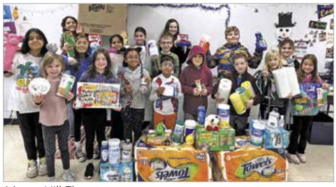
Manor Hill Elementary