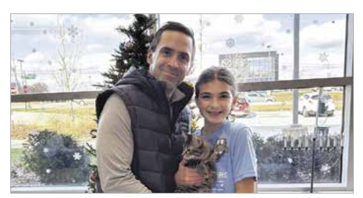
Clarendon Hills Daisy Dash