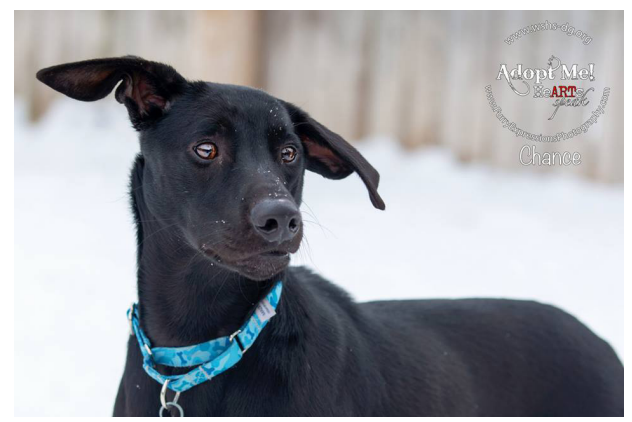
Chance waiting to find his forever home

We want to give our animals every available opportunity, so Chance has been allowed to go to special training to learn hand signals. For a deaf dog to be able to communicate for the first time is a wondrous sight and Chance would never have had this opportunity without the backing of the WSHS supporters. We are proud to be able to give all the homeless animals at WSHS the same medical and behavioral care to which your own dogs and cats have access.