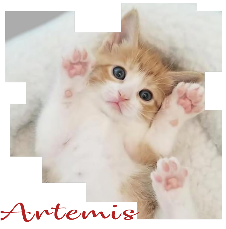
Adopted December 2020

To help you get started on your plans and legacy, you can use FreeWill, an online tool that guides you through the process of creating your will or trust. It's easy to use, accessible online and can be completed in 20 minutes. You can use this resource on its own, or use it to document your wishes before finalizing your plans with an attorney.