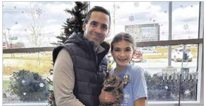
Clarendon Hills Daisy Dash