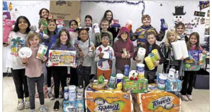
Manor Hill Elementary